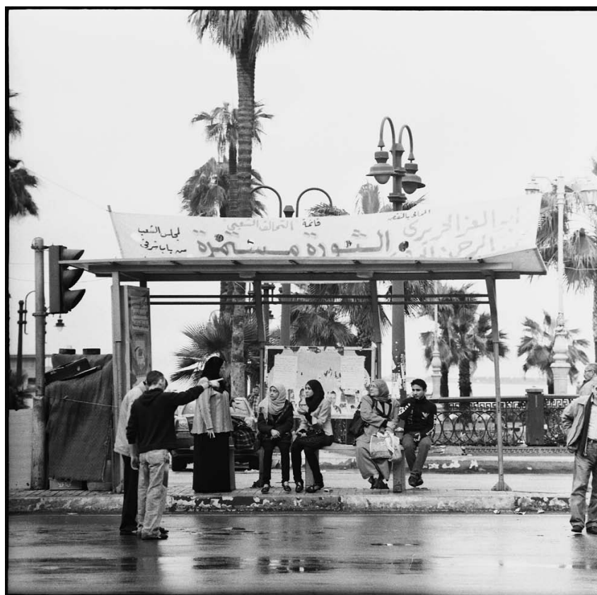
"The revolution continues"—a campaign poster of the socialist Popular Coalition. Alexandria, November 2011.

Religious, political, intimate, commercial and other messages fill the public spaces of Alexandria, Cairo and other towns and villages with continuous commentary. Notices can be spray-painted on the wall, written spontaneously with jumbo markers, rendered in vivid