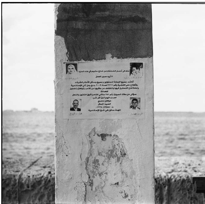
"Appeal to all supporters of the weak without rights in this world. I seek only justice." The notice goes on to list the license number of a car that struck another, killing the wife and daughter pictured on the top right and top left, leaving the father and son behind. Thus far, the notice says, the courts have done nothing. Alexandria, October 2011.