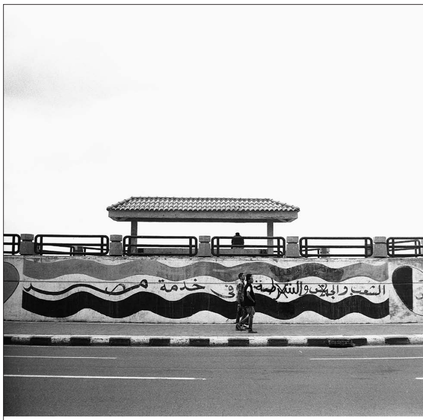
“The people and the army [crossed out] and the police [added, then crossed out] in the service of Egypt.” Alexandria, October 2011.