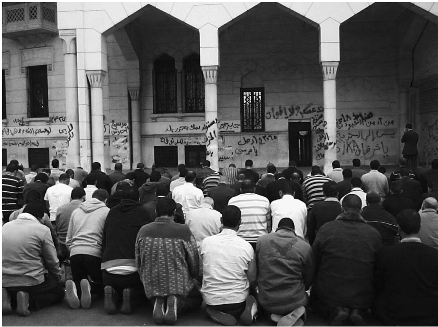
Pro-Mursi demonstrators perform evening prayers in front of the Presidential Palace, covered with opposition graffiti, December 5, 2012. Later that evening, opposition protesters were detained and tortured nearby. JESSICA WINEGAR

aspects of Egyptians' personal and social lives.