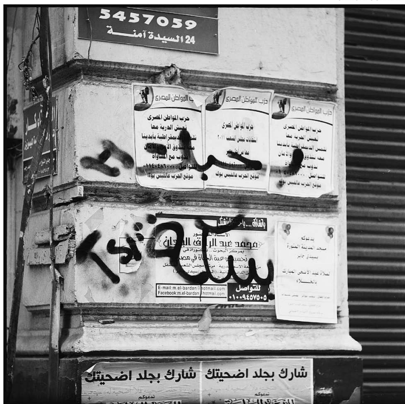
“I love you,” spray-painted amidst campaign posters and calls to prayer. Alexandria, November 2011.