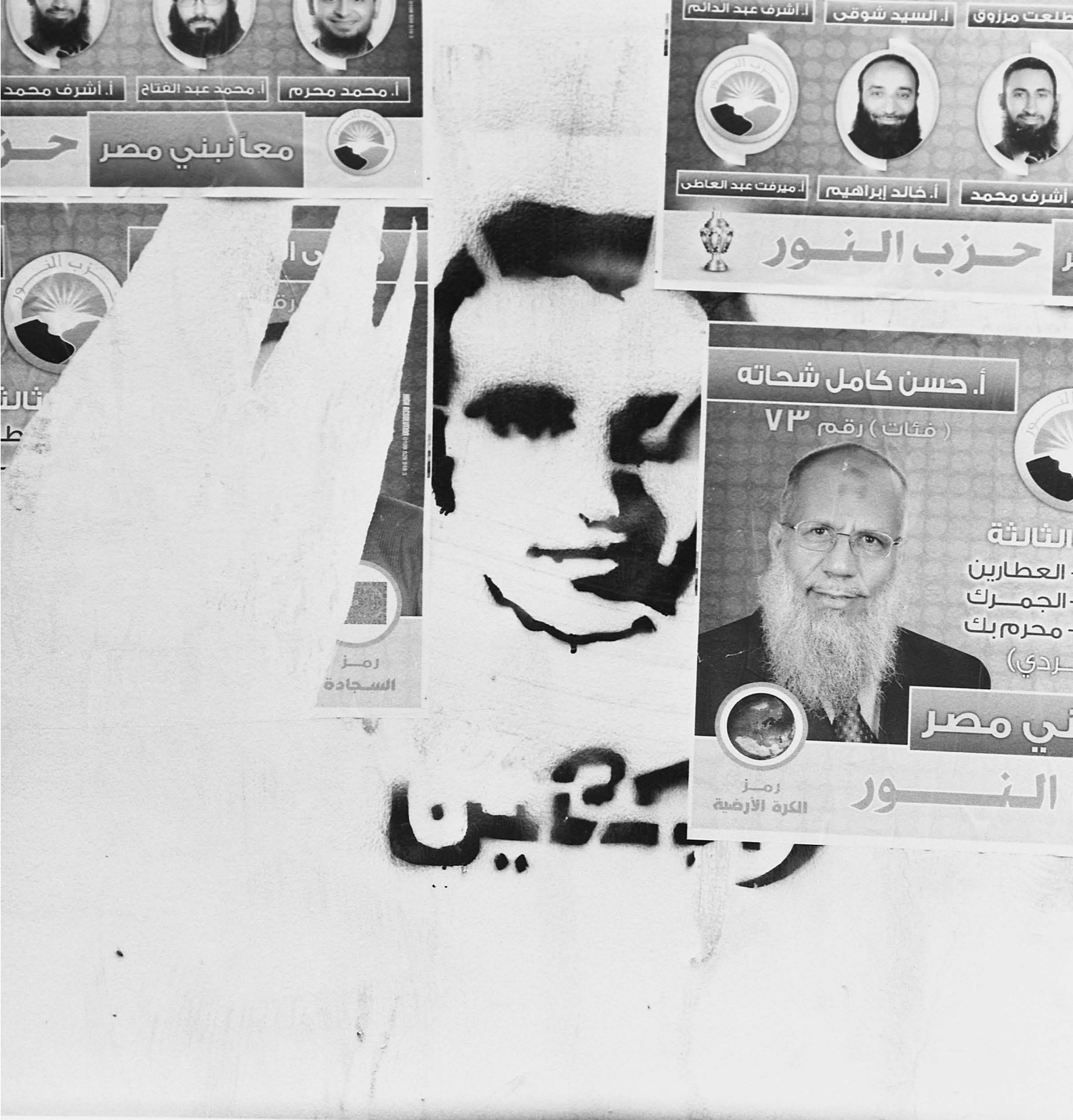
Stencil portrait of Khalid Sa'id, with text, "We'll be back," surrounded by campaign posters of the salafi Nour Party. Alexandria, November 2011.